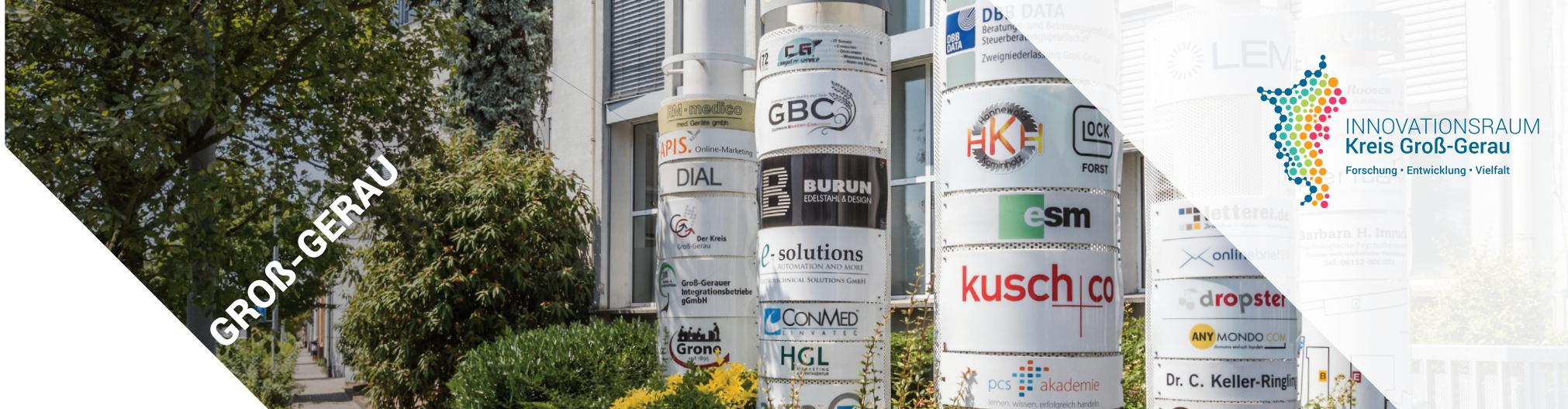
Detailed view of Groß-Gerau county